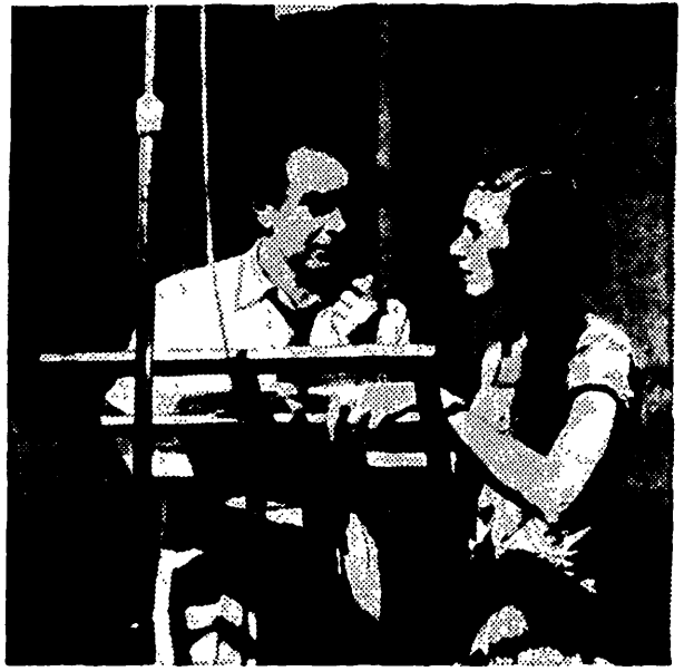
Tyrone Power rehearses poetry reading in New York studio of Caedmon Records.

Women who wonder if frequent removal will increase the growth of unwanted hair often decide to "get rid of this hair for good." Is it true that shaving, tweezing, and using depilatories makes hair grow back thicker and coarser? And is it safe to have hair removed permanently? Read the full facts in February Good Housekeeping, out today.