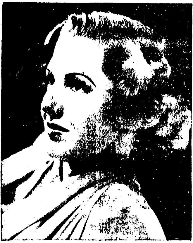
The exquisite loveliness of youthful Jean Arthur is kept freshly fascinating by her intelligent healthy schedule. A wise little beauty is she!

If I were in my "teens today I would boast loudly of using only lipstick and nail polish both in shades flattering to my general coloring. Of course, I would take care of my skin and hair with beauty aids, but I would get along without rouge, eye make-up, heavy powder and other artifices except for special, special parties when I wanted desperately to be a bit "grown-up." Even then I would use all make-up sparingly making it enhance my young beauty and not allow it to cover it.