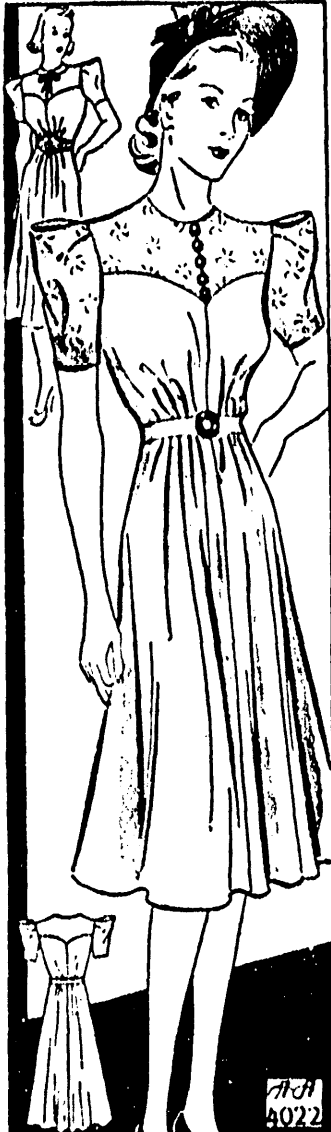
Contrast For A Young Frock PATTERN 4022