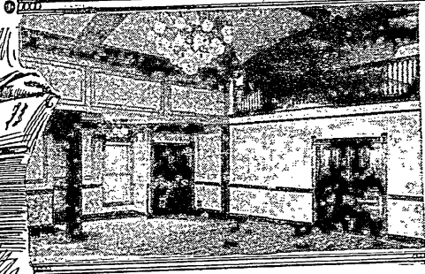
Upper picture—Exterior view of the school building. Lower picture—Interior view showing the extensive improvements made.

Solemn religious exercises and feasting will mark the dedication of this educational and social center. Jews within a radius of 100 miles are expected to attend the opening exercises, which will start at 2 p. m. and continue until midnight.