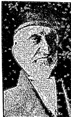
Noted Jewish Philanthropist and Teacher, born Oct. 26, 1784; died July 28, 1855.