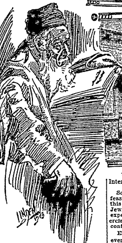
SIR MOSES MONTEFIORE.