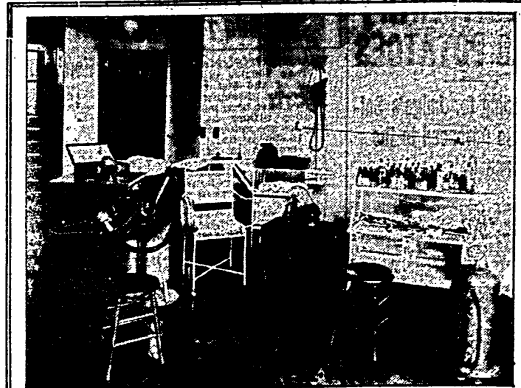
A Corner of the Instrument Room.