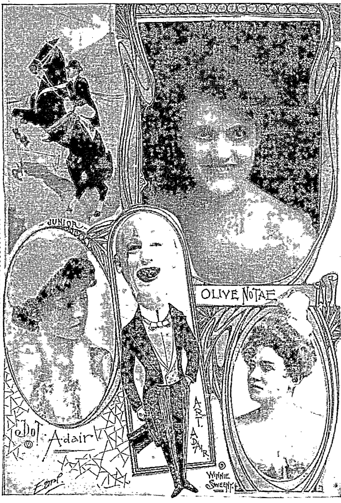
SOME OF THE ARTISTS IN THE HAGENBECK-WALLACE SHOW

When one thinks of the numerous possibilities for adding beautiful decorative pieces of pottery to the home in the way of lamp bowls, candlesticks, dishes for flowers or fruit and all kinds of decorative jardiniere, it seems well worth while to learn how to make these at home. The deepest hole in the world has been bored in Silesia. It has reached a depth of 7,000 feet, and passes through 52 beds of coal.