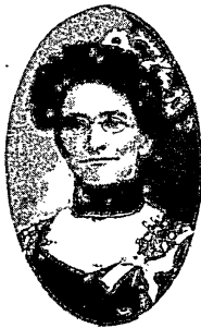
of Ovid, Ind. President N. S. S. C.

the same little loving work for another little suffering invalid in Lawar, Mo. September 28 will be her birthday and this dear little shut-in girl is going to meet her with a dainty little dollie, all dressed; clothes enough to last a whole year, and so cunning that we know the little girl will be overjoyed. Even a little blue crocheted hammeck will be one of dolly's comforts.