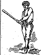
A 5th Grade, Mavy School.