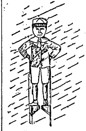
A 5th Grade, Washington School.