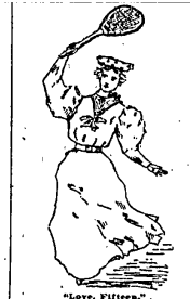
A 5th Grade, Emerson School.