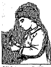
B 5th Grade, Washington School.