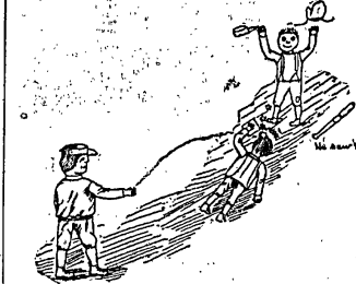
A 5th Grade, Bremer School.