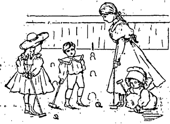
A 5th Grade, Horace Mann School.