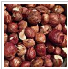
Heavy Table Hot Five: July 24-30