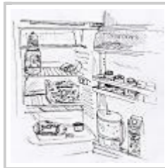
What’s in Prince’s Fridge?