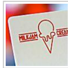
The “All of Them” Sundae at Milkjam Creamery