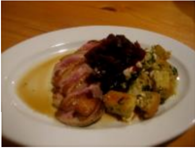
Jena Modin / Heavy Table

Preserve in Bayfield, WI, alongside a mint panzanella salad made with ciabatta from Franklin Street Bakery in Minneapolis.