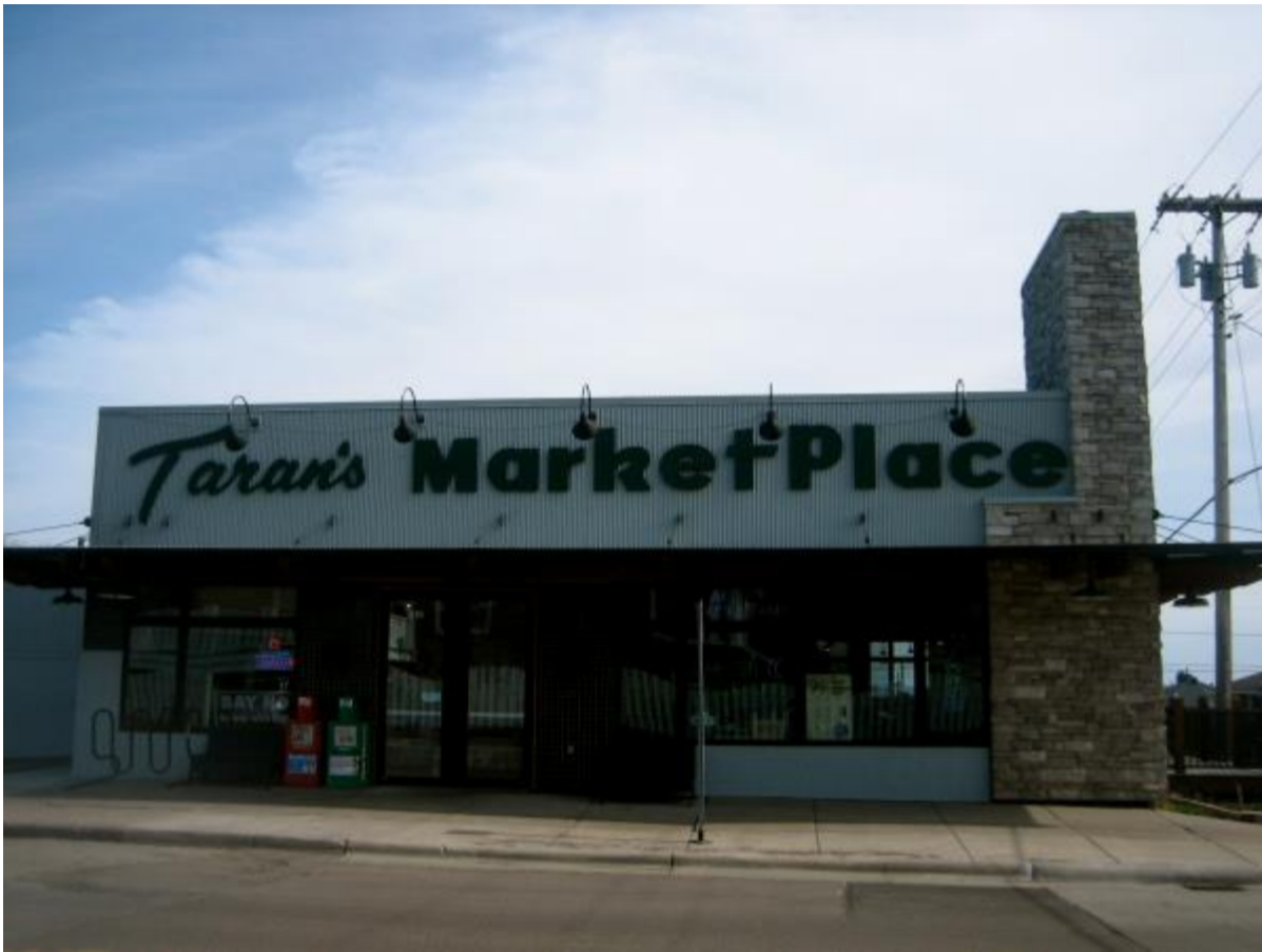
Jena Modin / Heavy Table

The sign on the building says “Taran’s Market Place,” the menus say “ At Sara’s Table Chester Creek Cafe ,” but to the regulars it is known as the most locally sourced meal you can get in town. General Manager Andrew Mattila says: “When people ask ‘What does your restaurant stand for?’ we say we stand for sustainability.”