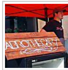
Abrothecary at Mill City Farmers Market