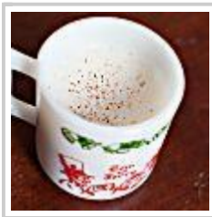
The Best Tom and Jerry, Updated