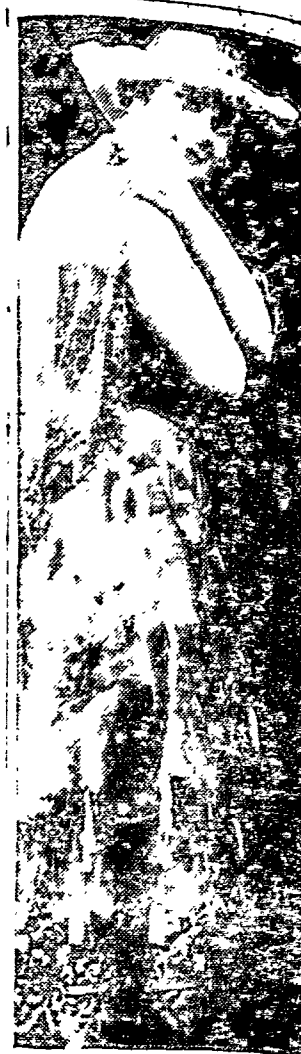
SOPHIE TUCKER AT THE ORPHEUM.